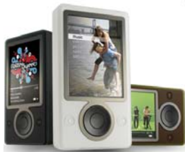
Portable Media Players