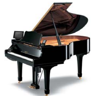
Audio / Video Devices