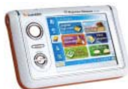
Portable Media Players